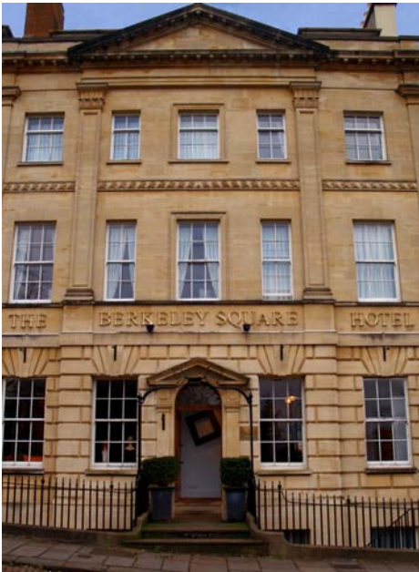
The Berkeley Square Hotel