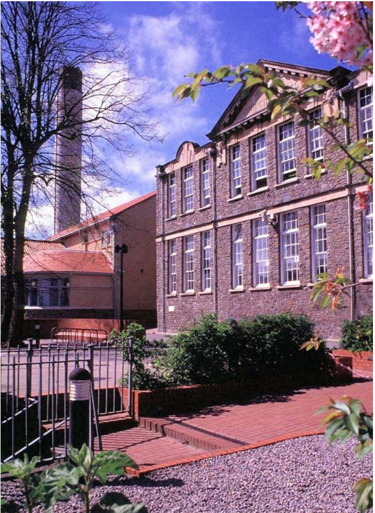
THE ANATOMY DEPARTMENT (200 yards along the same street as St Michaels' Maternity Hospital)